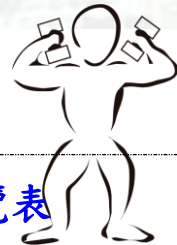
紹謨紀念體育館重量訓練室 113 學年度第 1 學期使用時間一覽表