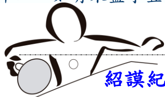
紹謨紀念體育館桌球室 113 學年度第 1 學期使用時間一覽表