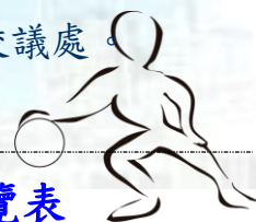
紹謨紀念體育館多功能球場 113 學年度第 1 學期使用時間一覽表