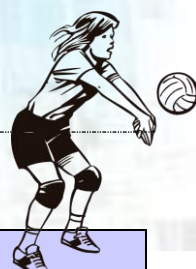
紹謨紀念體育館排球場 113 學年度第 1 學期使用時間一覽表