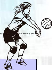
紹謨紀念體育館排球場 110 學年度第 2 學期使用時間一覽表