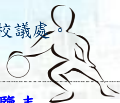
紹謨紀念體育館多功能球場 110 學年度第 2 學期使用時間一覽表