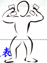
紹謨紀念體育館重量訓練室 110 學年度第 2 學期使用時間一覽表